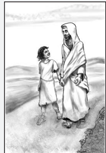
Jesus walked the dirty roads of ancient Galilee.

Think about all the mistakes you make. What reward do you think you should get for your wrong words and actions? But what does God offer you anyway?