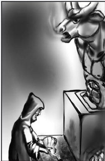
People killed animals and offered the meat to the gods in temples.

A false god can be more than a stone or wood statue. We can make false gods from almost anything. What false gods, if any, do you need to give up in your life?